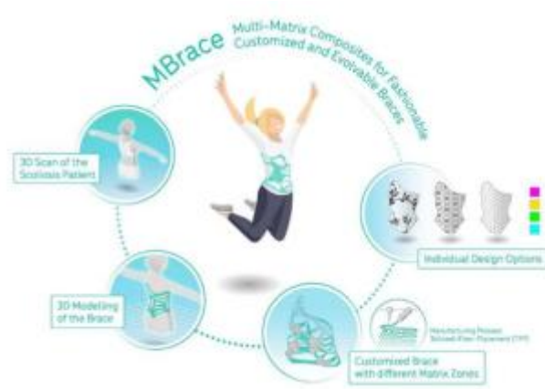
Illustration of the brace design and the M-Era.Net MBrace project programme