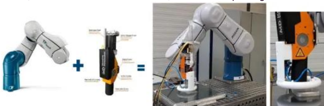
Illustration of the 3D freeform technique perfected by Sirris.

To achieve this aim, specific technologies and tooling will need to be developed, produced and improved, at a reasonable cost. To do so, Freeform 3D printing will serve as the support robotic arm.