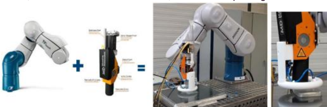
Illustration of the 3D freeform technique perfected by Sirris.

To achieve this aim, specific technologies and tooling will need to be developed, produced and improved, at a reasonable cost. To do so, Freeform 3D printing will serve as the support robotic arm.