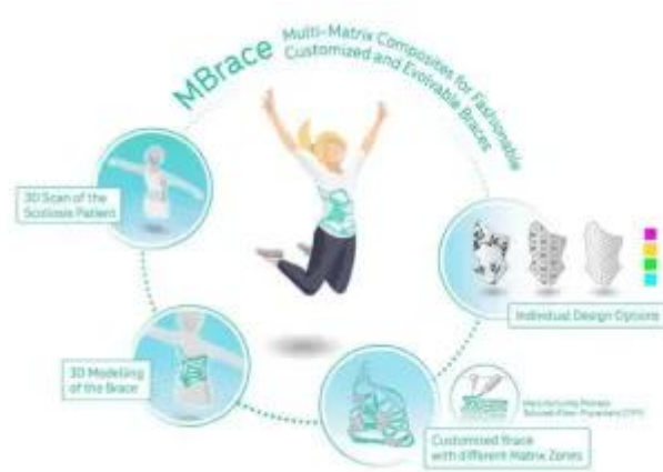
Illustration of the brace design and the M-Era.Net MBrace project programme