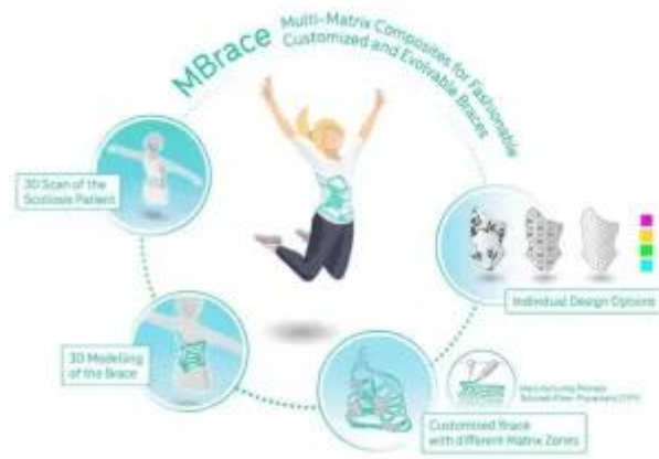
Illustration of the brace design and the M-Era.Net MBrace project programme