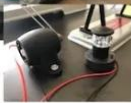
Single dynamo + lamp