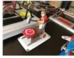
Virunator in our fight against COVID19