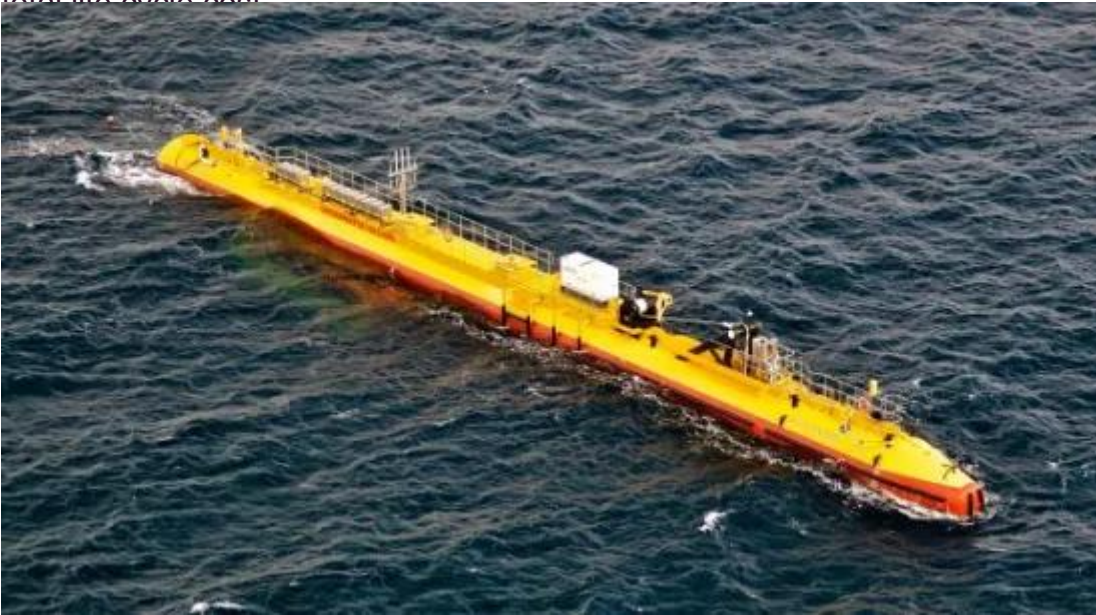
Tidal energy device

significant part of the O&M expenses (Operations & Maintenance), which makes up 15-30% of the total life cycle cost.