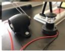
Single dynamo + lamp