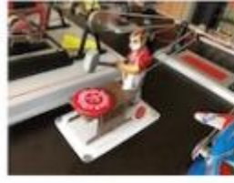
Virunator in our fight against COVID19